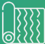
Textiles and leather

At Medir Ferrer, we have products that meet the needs of different industry segments