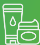
Cosmetics and personal care