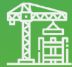
Building and construction